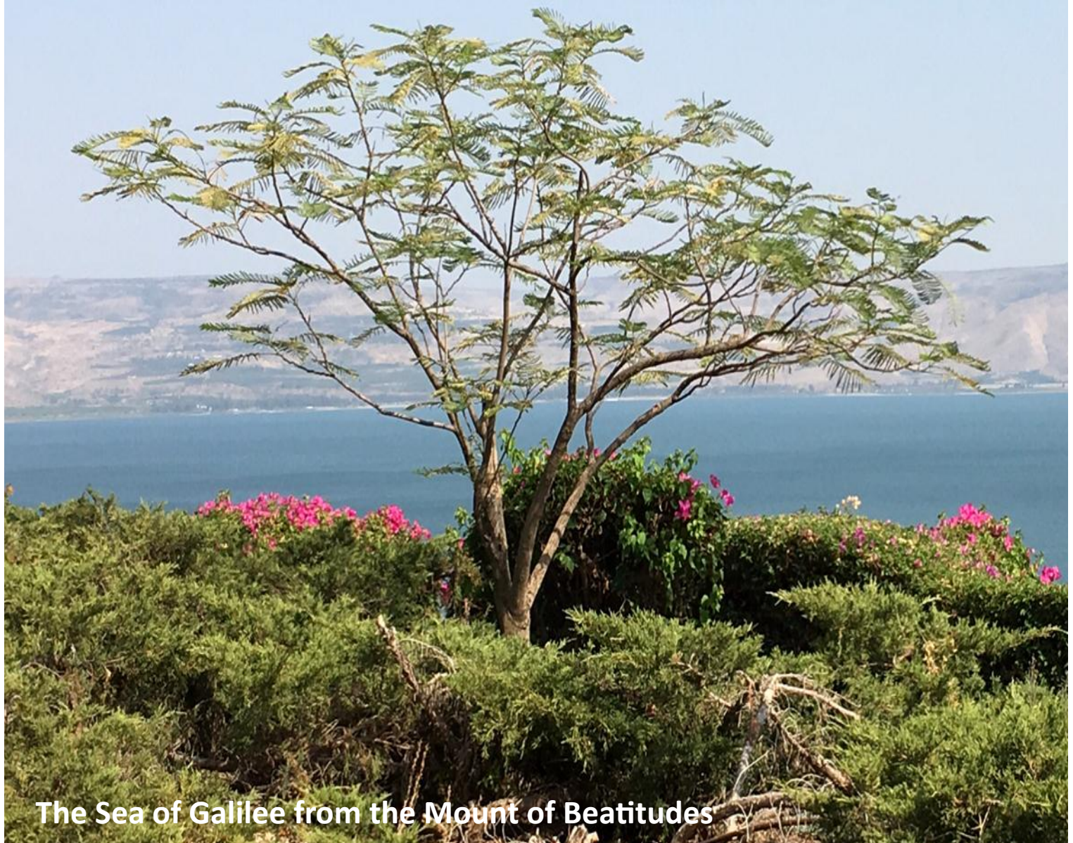
The Sea of Galilee from the Mount of Beatitudes